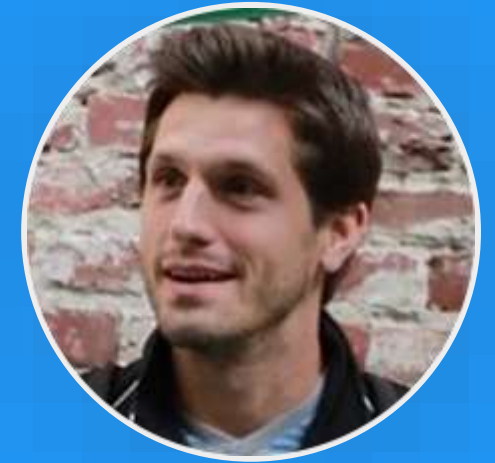
Cory Product Lead